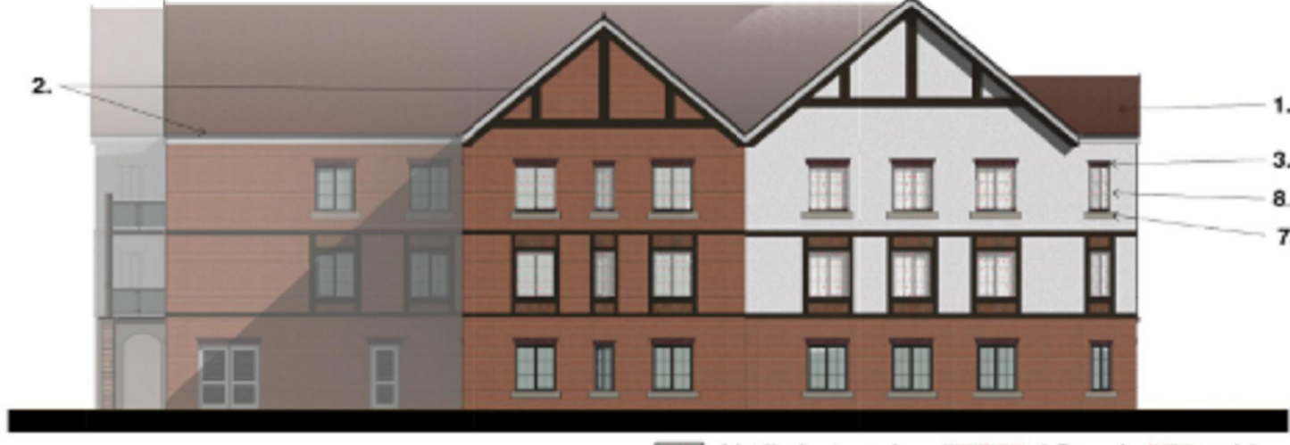
Block B - West Elevation 1 : 200

***All glazing above ground floor level on this elevation to be obscure glazed.***