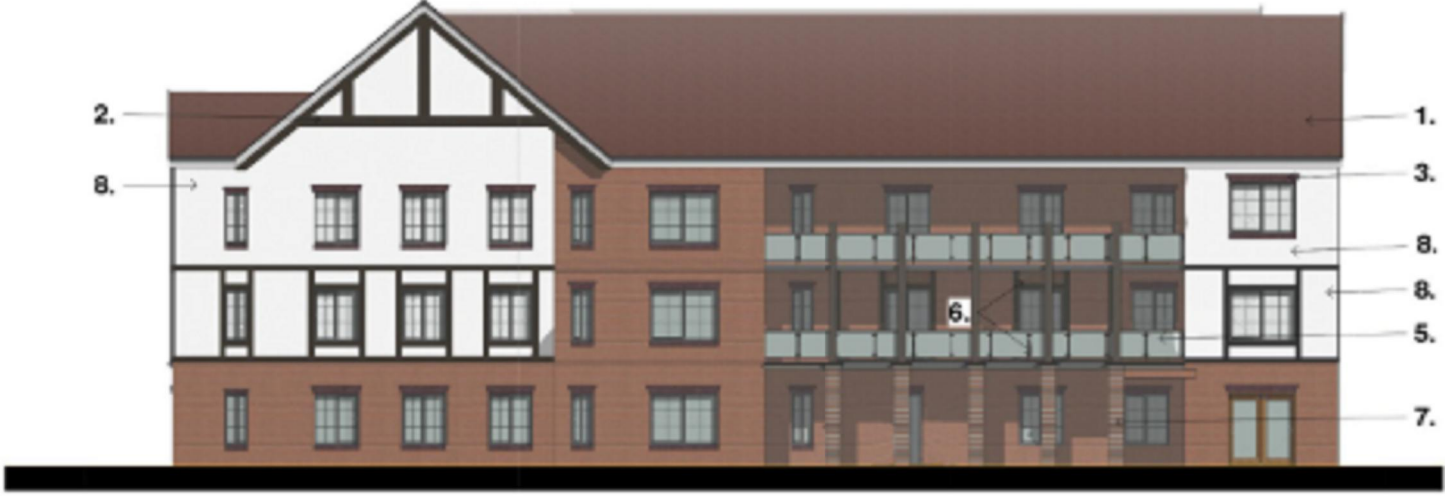
Block B - East Elevation 1 : 200