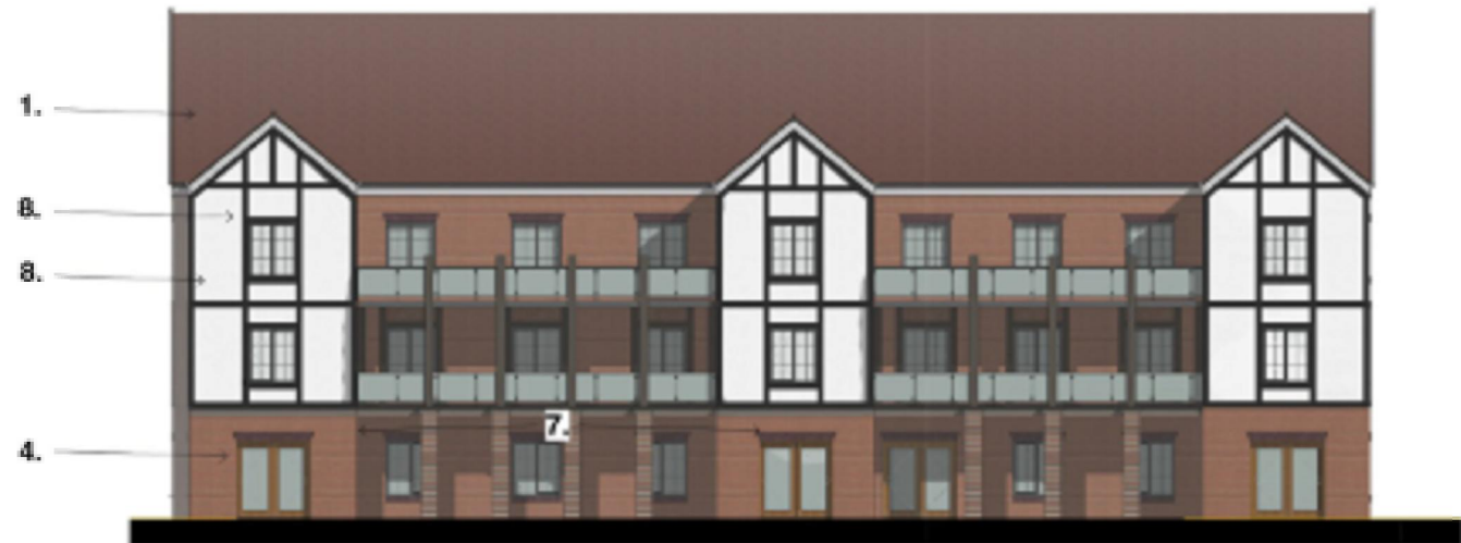
Block B - South Elevation 1 : 200

***All glazing above ground floor level on this elevation to be obscure glazed.***