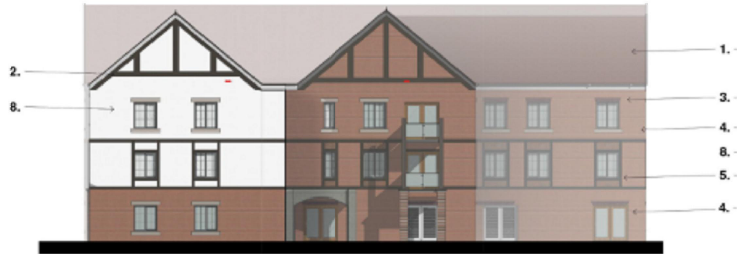
Block B - North Elevation 1 : 200